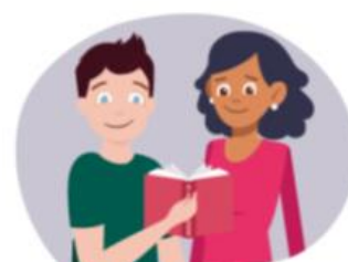
Workshop Lessons Plans