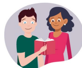
Workshop Lessons Plans